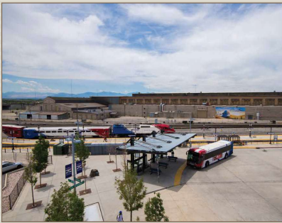
Salt Lake Central Station, Looking West Toward Historic D&RGW Locomotive Shop, 2014.