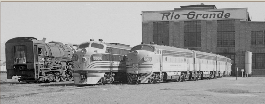
Historic D&RGW Locomotive Shop, Looking South, 1950. The bricks around the base of this display are from the historic site.

The D&RGW railroad route from Denver to Salt Lake City that was completed in 1883 enhanced the community and economy by bringing additional people, goods, and jobs to Utah. The new route helped to establish Salt Lake City's prominent status as a rail hub. Shortly after the route was completed, D&RGW constructed a railroad maintenance facility at the site to your west where the Locomotive Shop was located. The original facility is shown in the Library of Congress map above from 1891 (left side of map with black smoke and roundhouse). Buildings at the site were replaced numerous times over the years as a result of fires.